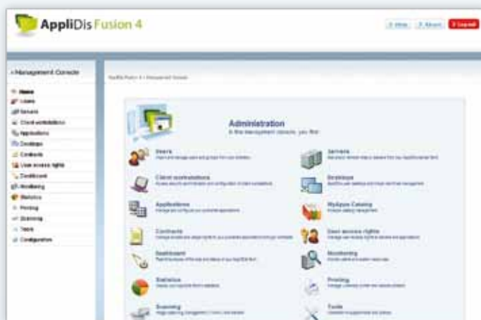
AppliDis Fusion 4 administration console

AppliDis Fusion 4 can deliver applications and desktops as a service: a single web console enables administrators to manage servers, applications, software licenses and access permissions, as well as create and manage virtual machines hosting a variety of operating systems which can all be delivered to hundreds of users across the enterprise with a single mouse click.